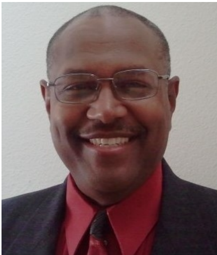
New Staff Member

The Council is uniquely positioned to offer management and technical services relevant for a dynamic marketplace including: business consulting, matchmaking, contract opportunity sourcing, finance sourcing and access to international markets.