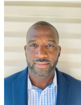
Isaac Opiyo Direct Freight Logistics